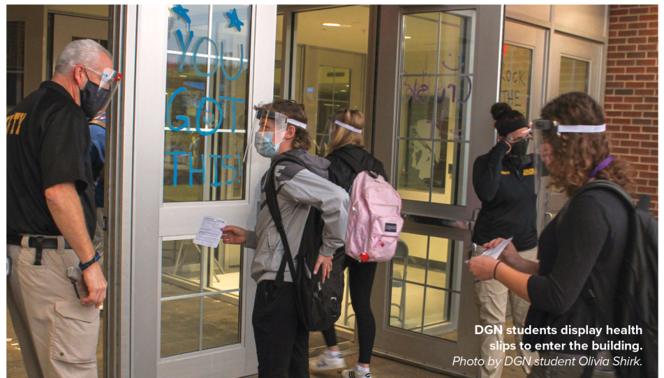
DGN students display health slips to enter the building.

Students have also organized to help those who are struggling. They've collected over 4,000 pounds of food and supplies for local pantries and shelters, packed up hundreds of “Bags of Hugs” for essential health care workers and donated thousands of dollars in gift cards. The District 99 Education Foundation has raised over $50,000 to date to further assist those in need and continues to accept donations.