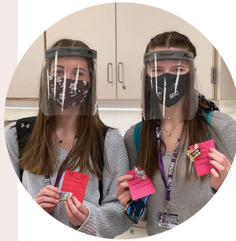
North High students pack Valentine's Day gifts for community members living in care facilities.

Find additional information at www.csd99.org/2020-21 .